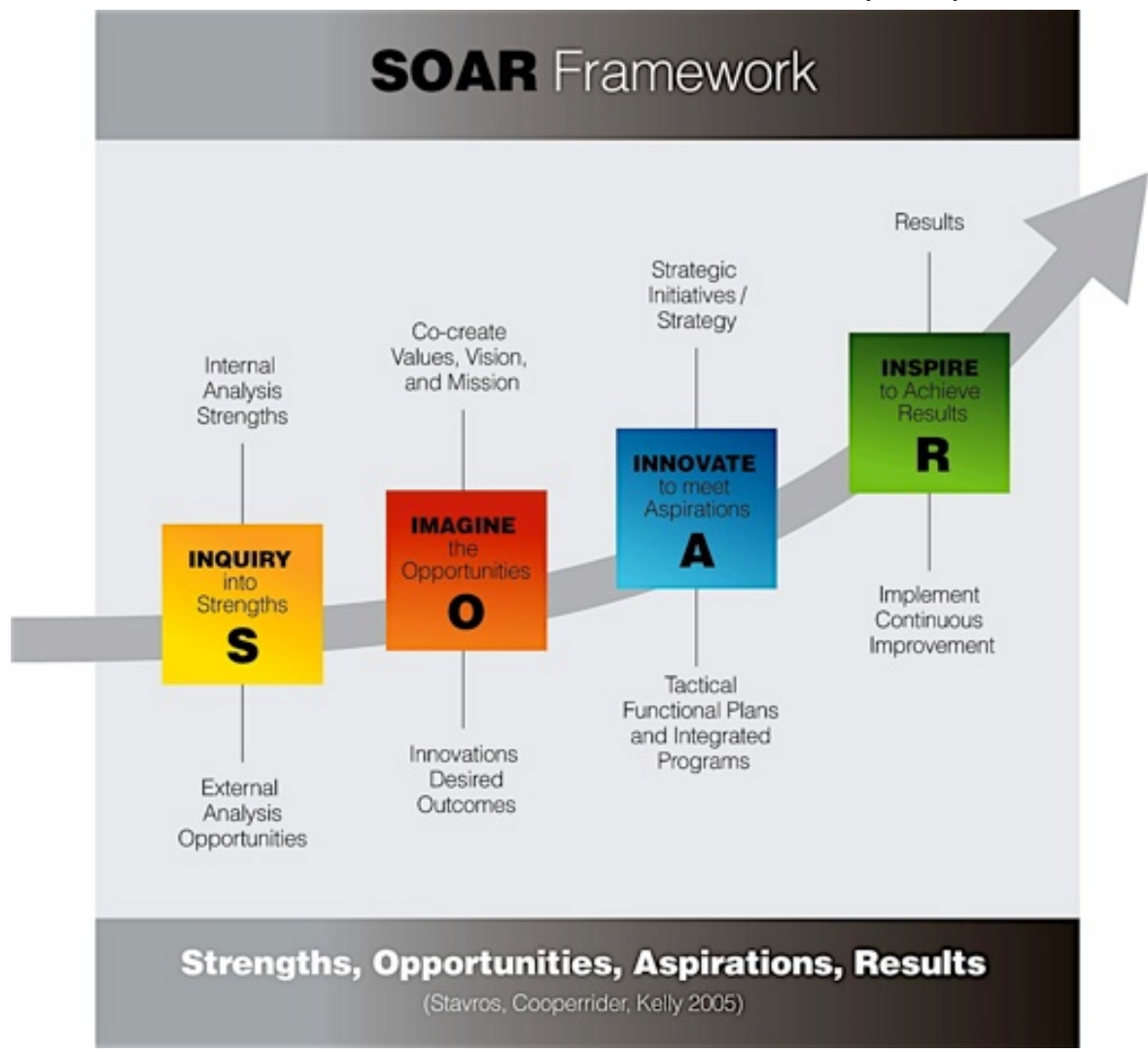
FIGURE 2: STRENGTHS, OPPORTUNITIES, ASPIRATIONS AND RESULTS (SOAR) FRAMEWORK

In contrast to the SOAR framework used in this report, the VHSSCO used the Strengths, Weaknesses, Opportunities and Threats (SWOT) analytical approach in 2011 to develop its VHSSCO Five-Year Strategic Plan. Comparing SOAR with SWOT, Silbert and Silbert (2007) contend, "Appreciative Inquiry and SOAR approaches to strategy development lend tremendous potential for success where traditional approaches, such as SWOT, fall short." (Page 4, <a href="http://www.atlantic.edu/about/board/documents/SOARfromSWOT.pdf">http://www.atlantic.edu/about/board/documents/SOARfromSWOT.pdf</a>). Figures 3 and 4 below compare the conceptual elements of SWOT and SOAR and depict the alignment of SWOT and SOAR, respectively (Capela and Brooks-Saunders, 2014, <a href="http://coanet.org/conference/program/workshops.html">http://coanet.org/conference/program/workshops.html</a>).